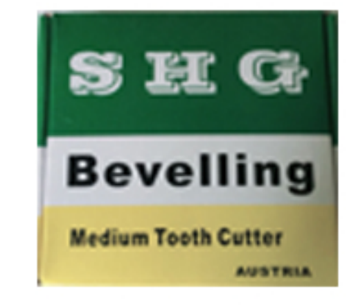
Medium Tooth Cutter 中強度刀具