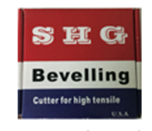
Cutter High Tensile 高強度刀具